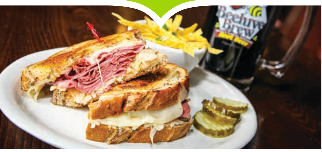
Beehive Pub and Grill