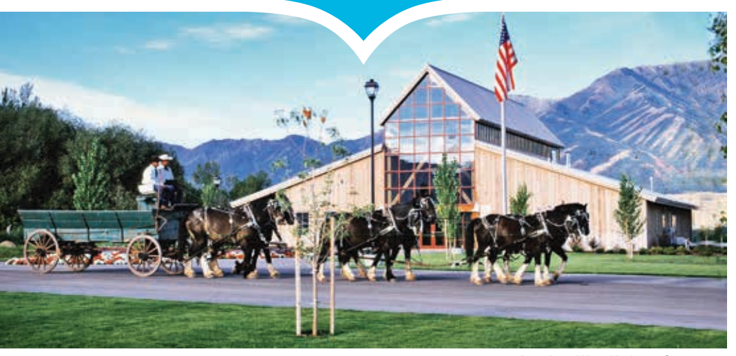
American West Heritage Center