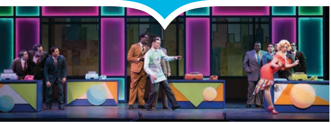
Utah Festival Opera & Musical Theatre

Logan's Freedom Fire Celebration and Fireworks Show, (held July 3rd), (435) 716-9250, loganutah.org . A patriotic celebration with spectacular fireworks and live