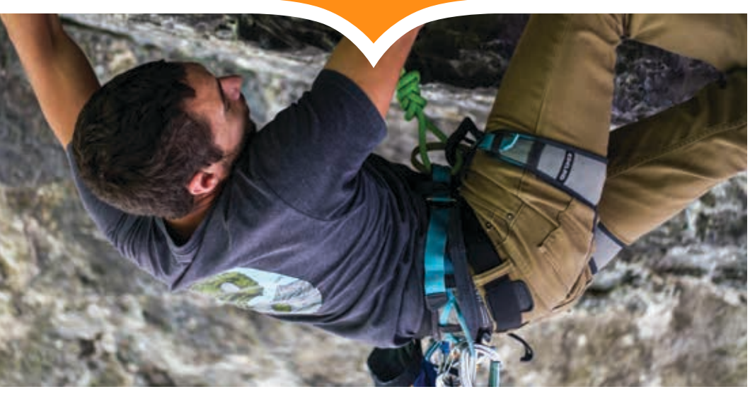
Rock Climbing in Logan Canyon