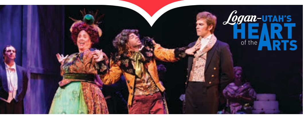
Utah Festival Opera & Musical Theatre