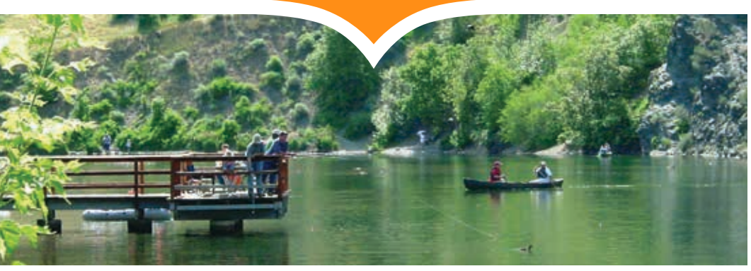
First Dam in Logan Canyon