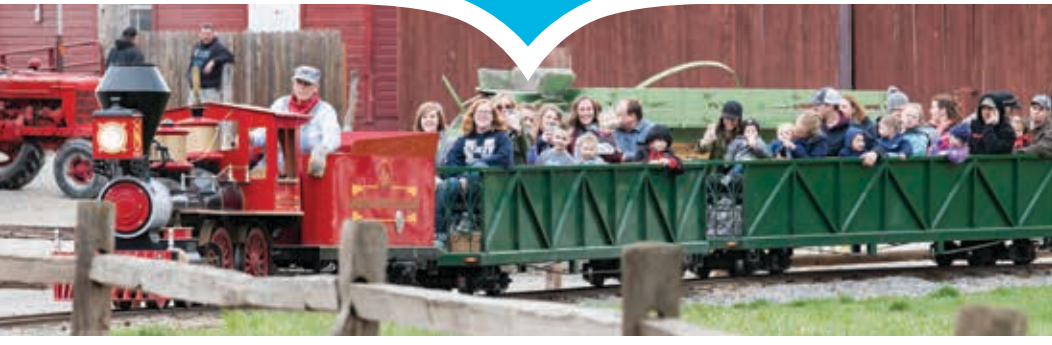
American West Heritage Center