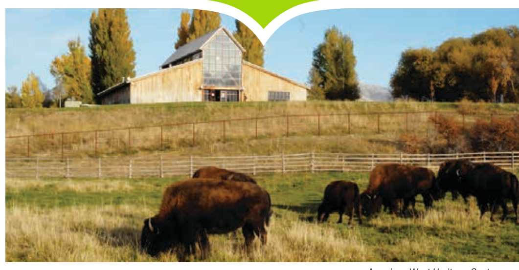
American West Heritage Center