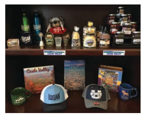
Cache County Courthouse and Visitors Bureau