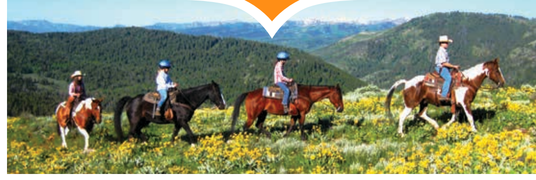
Horseback riding with the team from Beaver Creek Lodge